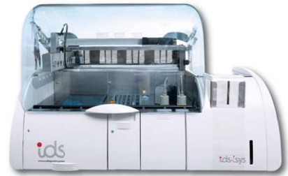
IDS-iSYS Multi-Discipline Automated System